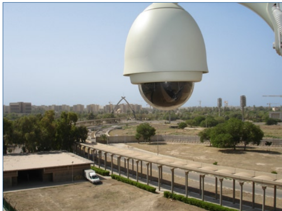
Day/Night High Speed Dome Camera installed in a highly secured site in Baghdad

Nashita designs special control rooms and installs quality furniture to provide a professional environment for operators to have full dominance on the system.