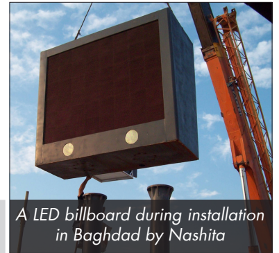
A LED billboard during installation in Baghdad by Nashita

The electronic signs also act as a multiple message provider, where one sign can show a loop of continuous messages. As for changing a sign message, it is as easy as clicking with a mouse button, rather than sending out a crew to pull down and replace a billboard message.